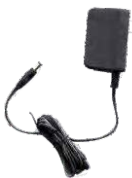
Switching Power Adapter