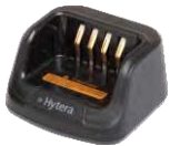
General MCU Rapid-rate Charger (for Li-Ion/Ni-MH batteries) CH10A07